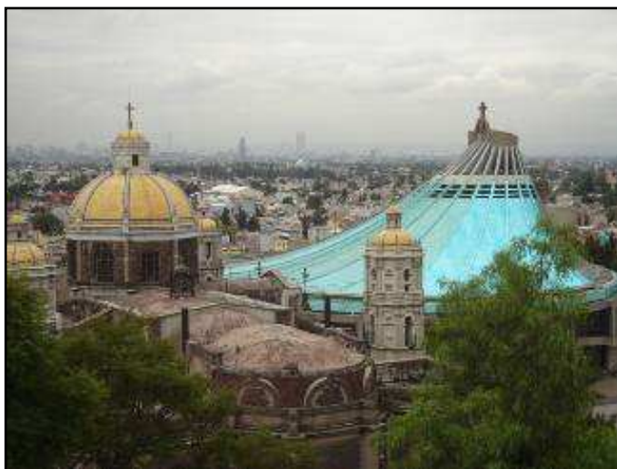
Shrines to Our Lady of Guadalupe, old and new Basilicas

After breakfast with the group, we will go to the Basilica area for a full day's visit, with time to get acquainted and for prayer. We will then participate in a Mass at the New Basilica. Afterwards we will visit the Old Basilica, now Perpetual Adoration Chapel. After some time for individual lunch we will visit the Basilica's Museum and then climb the Tepeyac Hill where the miracle of the Roses happened and where tradition holds that the first time one goes to the Shrine at the top of the Hill, a Rosary should be prayed during the ascent. On the way down we will visit the Chapel of the Well and the Parish of Indians. After all this has been accomplished we