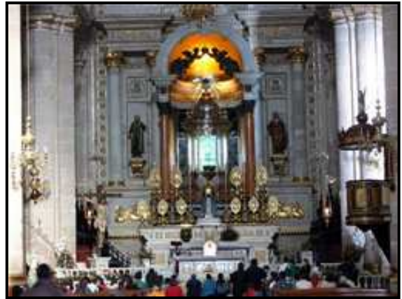
Basilica of San Juan de los Lagos

Breakfast with our group before we ride to the city of San Juan de los Lagos where we will participate in the celebration of the Mass and time for prayer with Our Lady of San Juan, a precious and tiny image of Our Lady which shares with Guadalupe the faith of the Mexican people. San Juan de los Lagos is a typical town nearby Guadalajara. We will have lunch in the area and then return to the city of Guadalajara for a free afternoon of visiting, shopping, and packing.