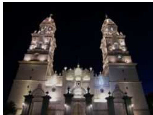
Cathedral in Morelia

After participating in an early mass at the Church of St. Phillip Neri, we will all have breakfast. Then we will get our luggage packed in order to leave for the cities of Morelia, in the State of Michoacán and Guadalajara, in Jalisco. We will start our journey stopping for lunch at the capital of the State of Michoacán, Morelia, where we will visit where we will visit the XVI century Temple of the Augustinians, where the Virgin of Aid, a present from St. Thomas, is venerated, and the House of Culture (now the Museum of the Mask and Folk Art). We will also visit the Cathedral. Then we will proceed to Guadalajara where we will spend the next couple nights.