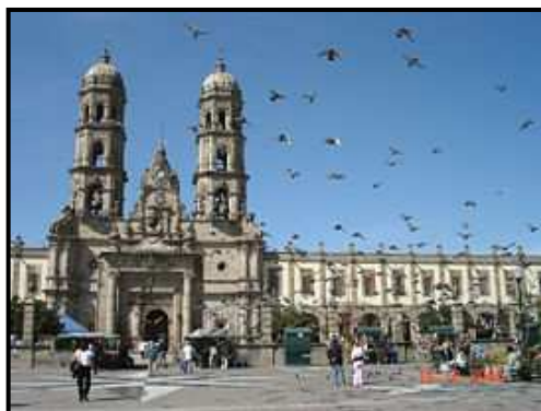
Basilica of Zapopan

Once we have had breakfast, we will participate in a Mass at the Basilica of Our Lady of Zapopan, Patron of the city of Guadalajara. Then we will enjoy lunch in the downtown area with time for an afternoon visit to the Cathedral, the Zócalo, and the Hospicio Cabañas, World Cultural Heritage, which holds some of the most important murals of painter Clemente Orozco. We will also ride the turibus around the city. Return to our hotel to spend the night.