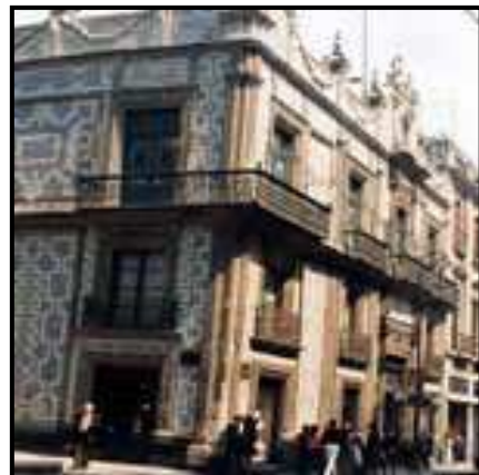
House of the Blue Tiles

We will start the day with breakfast with the group at the House of Tiles and then have Mass at the Chapel of Guadalupe in the Church of St. Francis, the first Catholic temple built in the Americas in 1525. After Mass, and visiting the Temple of St. Phillip of Jesus – the first Mexican martyr and the only church where the Blessed Sacrament has been exposed since the 1920's, we will visit the National Museum of Anthropology. We will have dinner at the museum's restaurant. Return downtown for a visit to the Cathedral and a view of the Palace of the Archbishop, where the Tilma was exposed to Bishop Fray Juan de Zumárraga on December 12, 1531. After a proposed walk in the area we will return to the hotel.