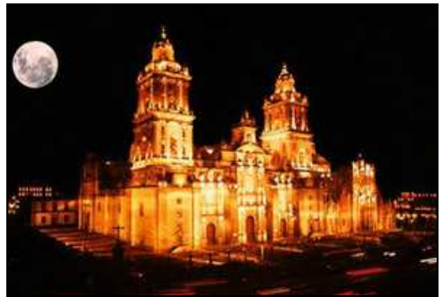
The Metropolitan Cathedral by night

The group will arrive at Mexico City's International Airport. From there we will drive to our hotel in the downtown area and check in. After allowing for necessary time to unpack, we will share our first dinner with the group at the hotel's restaurant. If time allows, we will all leave for a first visit to the Basilica of Guadalupe and a view at night of the Tilma; if possible having our first Mass in the Shrine. Then we shall return to our hotel for the night.