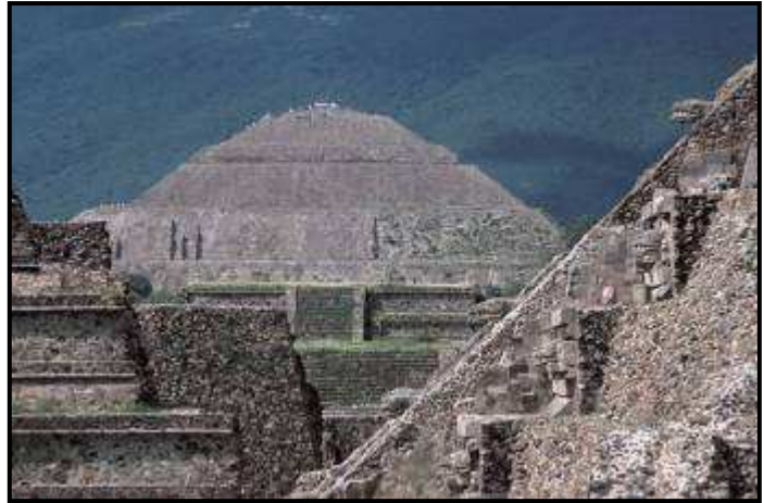
Teotihuacan, archaeological center

Juan Diego's uncle was miraculously healed at the same time Our Lady appeared to St. Juan Diego at Tepeyac Hill and insisted he visit the Bishop and tell him of her wish to have a Sanctuary built. We will hopefully get to talk to the brothers from the "Hermanos de San Juan Diego" order, a Mexican-American congregation which works with the underprivileged people in the area. From here we will continue our day driving to San Juan Teotihuacán, in order to visit one of the most important archaeological centers of Pre-Hispanic America. We will have lunch with the group enjoying the impressive view of the site with time to visit, shop, and walk around. For those with enough energy we suggest climbing the Sun and Moon pyramids. After this we will return to Mexico City for a last visit to the Basilica before we return to the hotel.