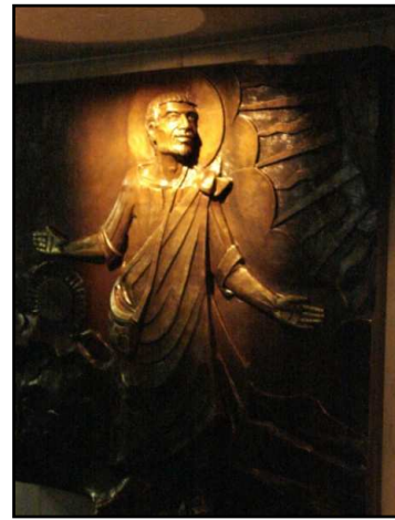
St. Juan Diego

most important archaeological centers of Pre-Hispanic America. We will have lunch with the group enjoying the impressive view of the site with time to visit, shop, and walk around. For those with enough energy we suggest climbing the Sun and Moon pyramids. After this we will return to Mexico City for a last visit to the Basilica before we return to the hotel.