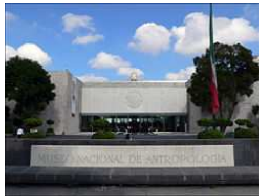
National Museum of Anthropology

We will start the day with breakfast with the group at the House of Tiles and then have Mass at the Chapel of Guadalupe in the Church of St. Francis, the first Catholic temple built in the Americas in 1525. After Mass, and visiting the Temple of St. Phillip of Jesus – the first Mexican martyr and the only church where the Blessed Sacrament has been exposed since the 1920's, we will visit the National Museum of Anthropology. We will have dinner at the museum's restaurant. Return downtown for a visit to the Cathedral and a view of the Palace of the Archbishop, where the Tilma was exposed to Bishop Fray Juan de Zumárraga on December 12, 1531. After a proposed walk in the area we will return to the hotel.